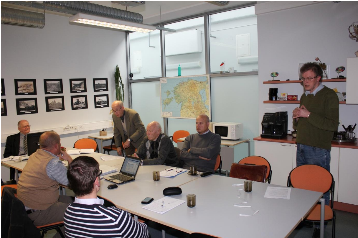
Figure 1 One of the regular meetings of Estonian Mining Society for discussions of professional standards in the Department of Mining of TUT

The main activities in seismic monitoring and analyses include cross country seismic analyses for large seismic events as blasting in oil shale open casts, limestone and dolostone quarries, construction blasting and military events. Small scale seismic monitoring and analysing is done in small scale blasting in quarries, construction, military and underground mining application. The main problem related to underground blasting in oil shale mines is related to the fracturing of support pillars, weakening of immediate roof layers causing danger of roof collapsing, pillar collapsing, mine section collapsing and land subsidence. Large scale blasting needs mainly optimisation analyses for even fragmentation of rocks, low seismic, dust and noise affect.